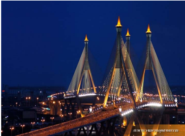
(Industrial Ring Road Bridge)

SIIT, Thammasat University Thailand 31 st July – 1 st August 2014